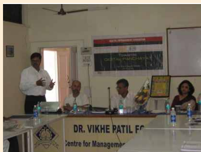
Session in progress ...