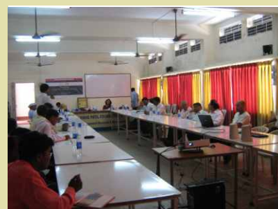
Participants during the workshop