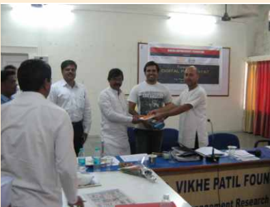
Panchayat members committing their support