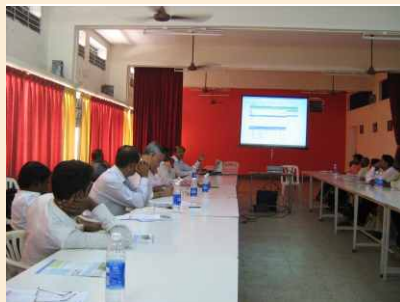
Members of PRIs learning about "Local Area Portal" developed by DEF