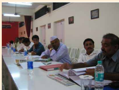
Presentations & sharing by Panchayat Pradhans