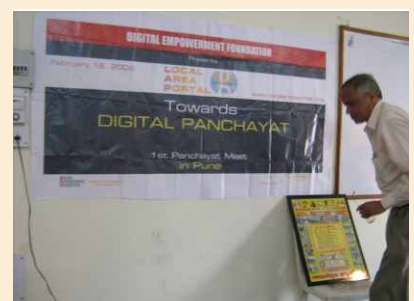
Efforts towards making dream a reality...