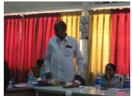
Distinguished participant sharing his views

I must emphasise that, DEF would be providing all hosting, technical support and capacity enhancement skills for making all Panchayats go for having digital content based website, thus making India a proud country for having the largest bottom-up content of its kind through having 265,000 Panchayat Portals online and that too managed and updated by the Panchayat.