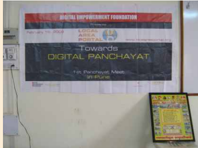
An effort towards making Panchayats digital in Maharashtra