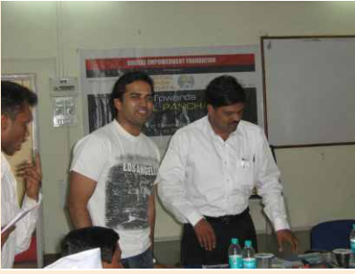
Supporters as a team during the workshop