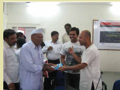
Enthusiasm among the participants towards collective efforts ...

This convergence for Sustainable development is inevitable and mutually Beneficial.