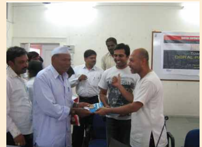
Happy moments during the workshop