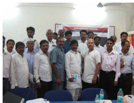
Committing towards common cause ... making Panchayats digital...

Rural Maharashtra has unlimited to offer, whether it is community mobilization, panchayat raj system, innovative implementation of rural technology, watershed management or natural resource management.