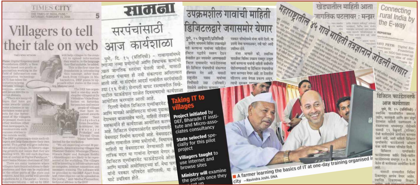
Media's presence & coverage

Following are the members of the PRIs participated, their signatures, their achievements, and their participation in the workshop and also press coverage.