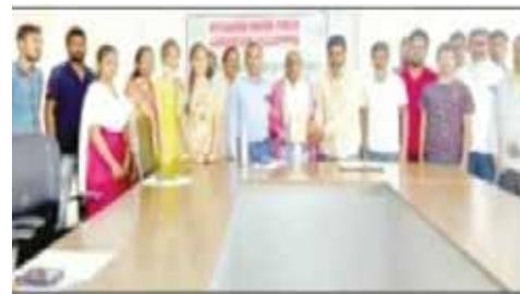
ఉత్తమ ప్రతిభ కనబరిచిన విద్యార్థులు