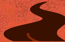
KOOCHAS & KATRAS