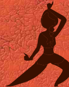
CULTURE & TRADITIONS