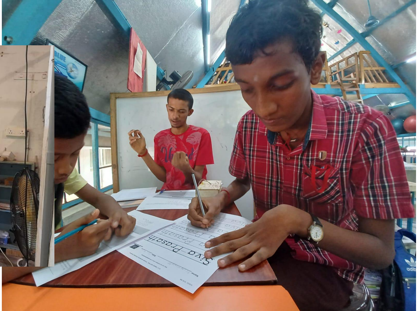
PwDs students are performing some experiments on STEM learning with the help of a trainer.